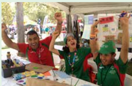
Athletes from Morocco celebrate!