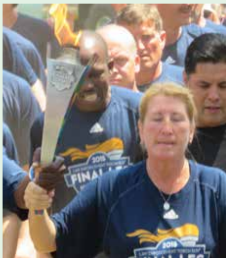
The Flame of Hope