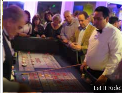
Let It Ride!