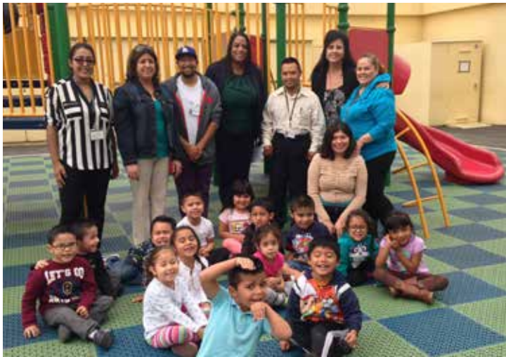
Tierra volunteers and Vaughn staff take a "time-out" at recess.